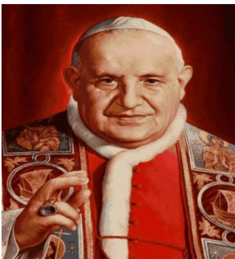
Pope Saint JOHN XXIII Angelo Giuseppe Roncalli