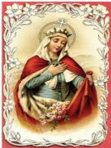
Prayer to St. Elizabeth of Hungary 1207 - 1231 Memorial - 17 November