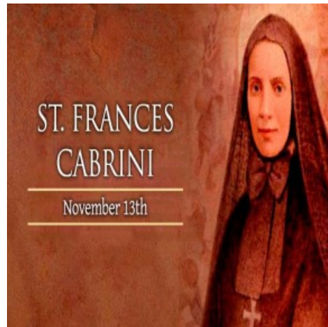
ST. FRANCES CABRINI November 13th

LADE FORD, INC. Family Owned and Operated Since 1957 120 S. Frankston Hwy. • P.O. Box 1045 • Frankston, TX 75763 Bus: (903) 876-2225 • Toll Free: (800) 308-1157 www.ladeford.com • www.ladefordinc.com