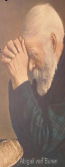
Abigail van Buren