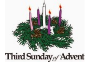
Third Sunday of Advent